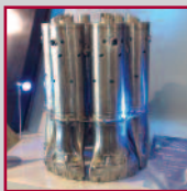
Jet Engine Exhaust Manifolds