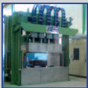
300 Tonne SPF Press

Diffusion Bonding (DB) is a joining process achieved by the application of load at elevated temperatures. The resultant molecular bond offers a fully homogeneous joint, which, in many cases, is undetectable under microscopic examination.