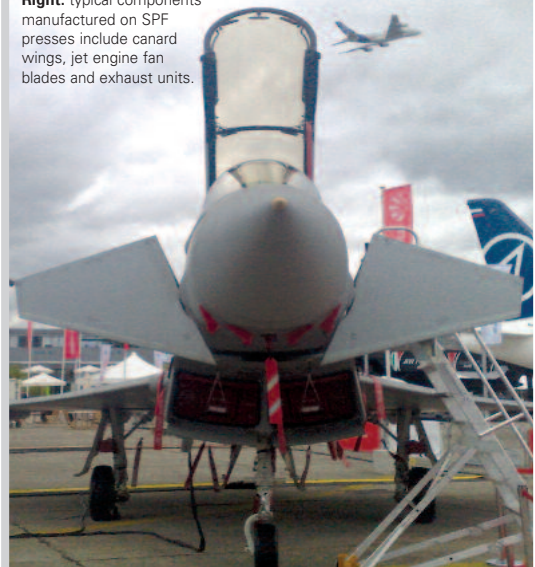
Right: typical components manufactured on SPF presses include canard wings, jet engine fan blades and exhaust units.