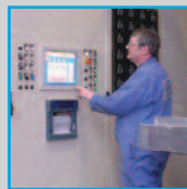
SPF Control System