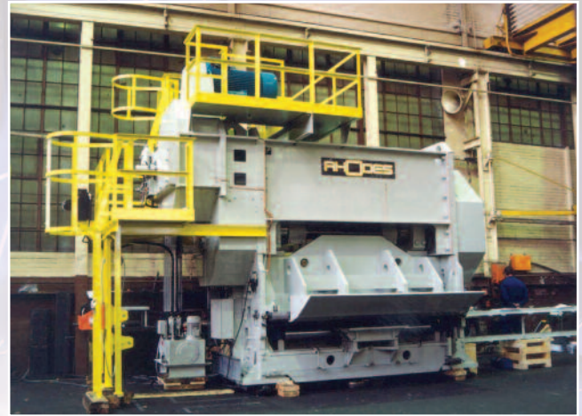
Customer: Hoogovens Aluminium N.V. Project: Rhodes Ultra Shear