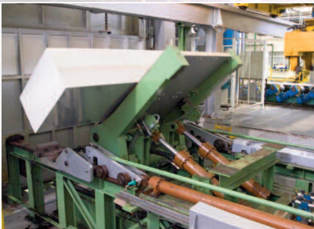
Customer: Solios Thermal Project: Aluminium Slab Downender