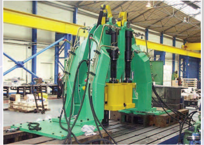
Customer: Anglesey Aluminium Project: Butt Stripper