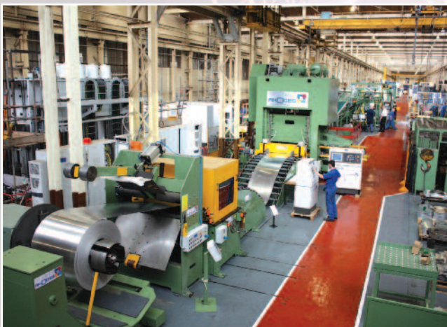
Customer: Hindalco Industries Ltd Project: Rhodes Integrated Stager Circle Punching Line