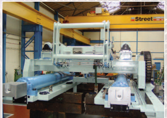
Customer: Garmco Project: Aluminium Slab Upender and Pusher