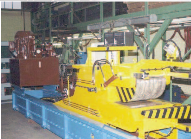
Customer: British Aluminium Project: Aluminium Section Stretcher