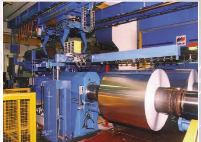
Customer: Alusuisse Project: Spool Handling Equipment