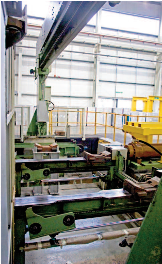
Customer: Solios Thermal Project: Shoe Handling Equipment